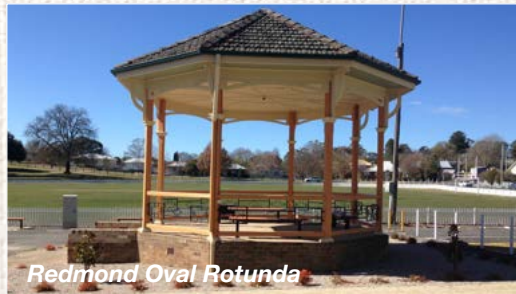
Millthorpe Garden Ramble Committee

The Redmond Oval precinct has been a focus for several years with plantings, fencing, upgraded kiosk, Rotunda renovations/seating.